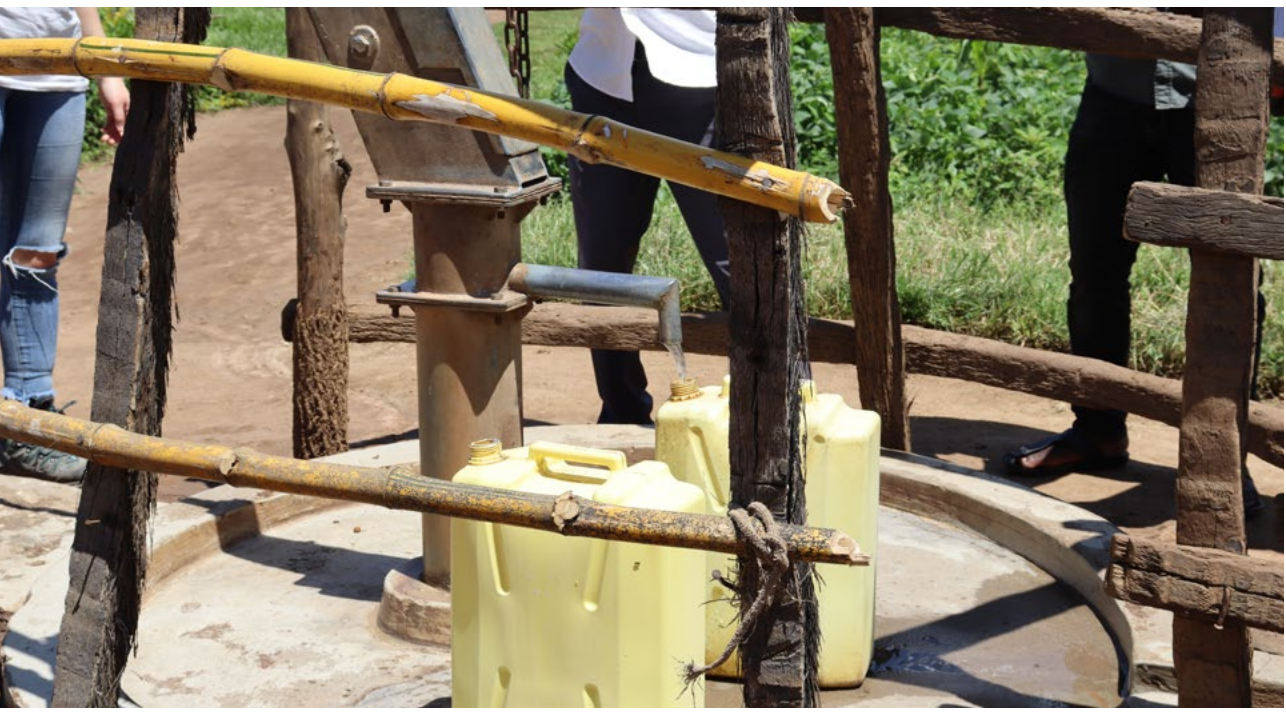
A team working on water boreholes, to provide fresh and clean water for a community in Uganda, with one of Canon Medical UK's CSR partners, C02balance.

The Aquilion ONE Genesis CT scanner is a Gold Winner of the Innovation category of the international Green Apple Awards , an annual accolade to recognise, reward and promote environmental best practice around the world. Its small and light design needs less power compared to other models and can be installed in compact spaces avoiding costly renovations at hospitals.