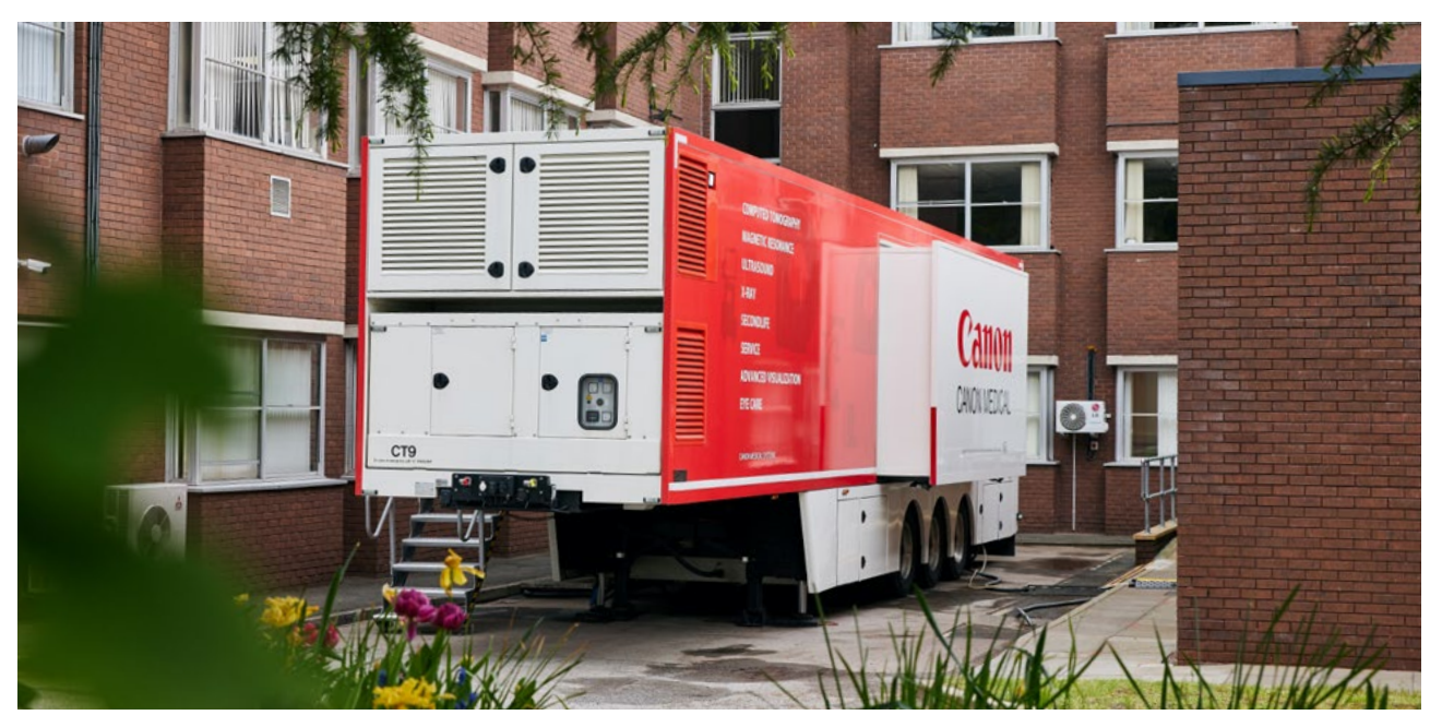
One of Canon Medical UK's CT Mobile Units, ready for action.

• Children are able to go to school as no longer required to help their families to walk miles to clean water wells far from their villages, or help collect firewood for old inefficient style stoves